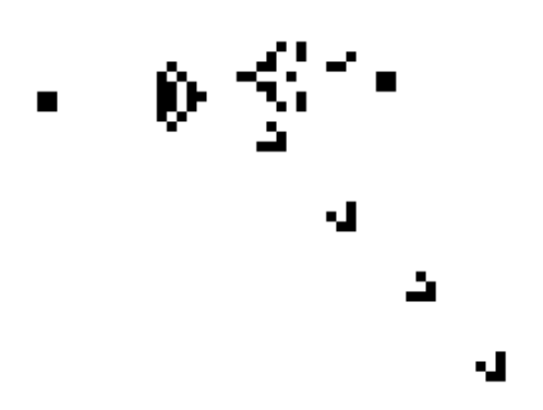
Figure 9.2: ... in action.