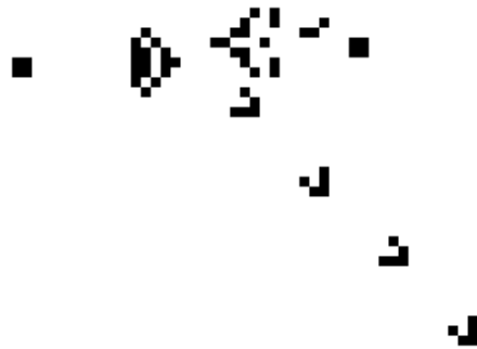
Figure 9.2: ... in action.